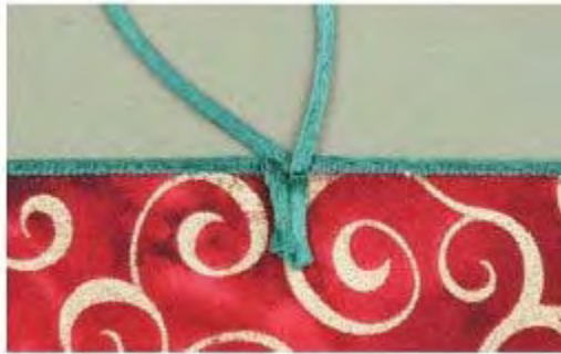
Leave cording at the start and a loop at the end.