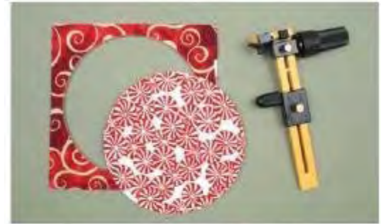
A circle cutter makes the job faster and easier.