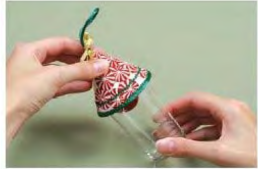
Cool to shape over a small glass after steaming.